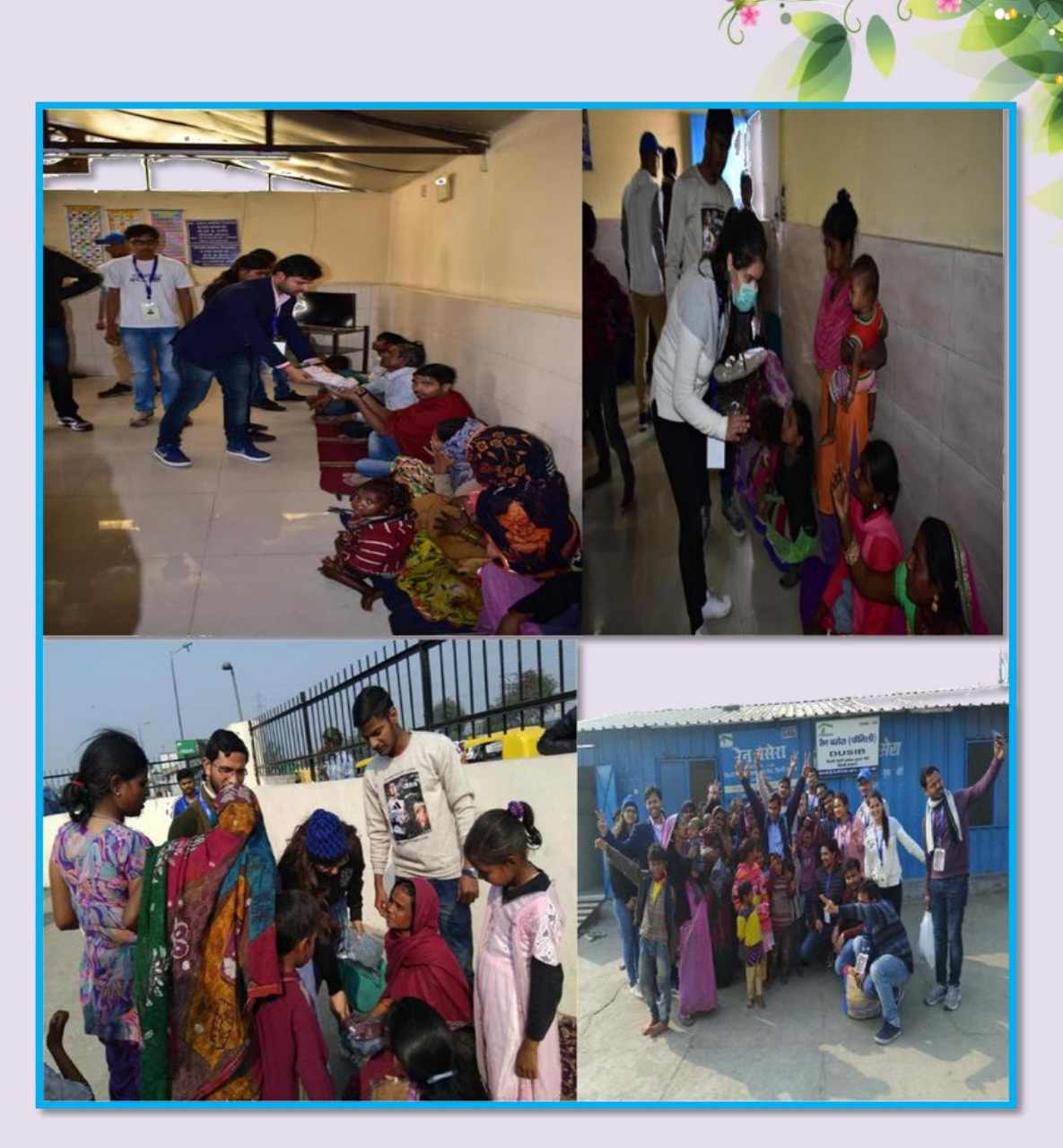
Then, we move to the Jhugi-Jhopri of Vasant Vihar near Petrol Pump which was our last point of the distribution drive.